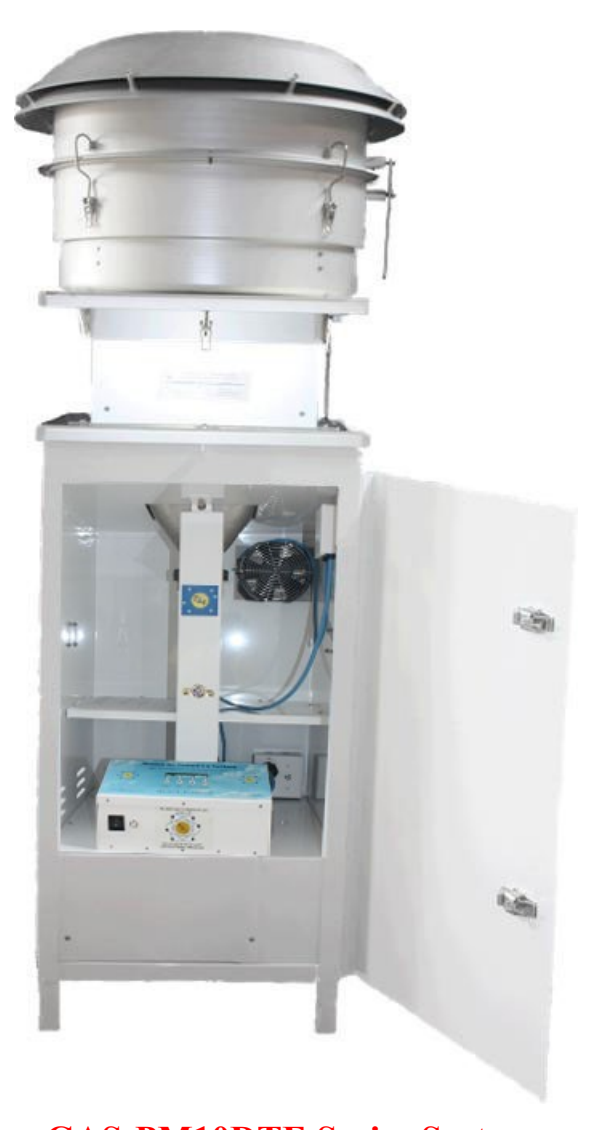
GAS-PM10DTE Series System Enclosure Door Open