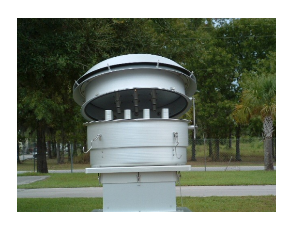
View of PM10DE Size Selective Inlet illustrating interior features