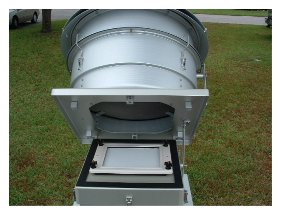
GAS-PM10DTE Series System PM10 Inlet Open Position for Access to Filter Paper