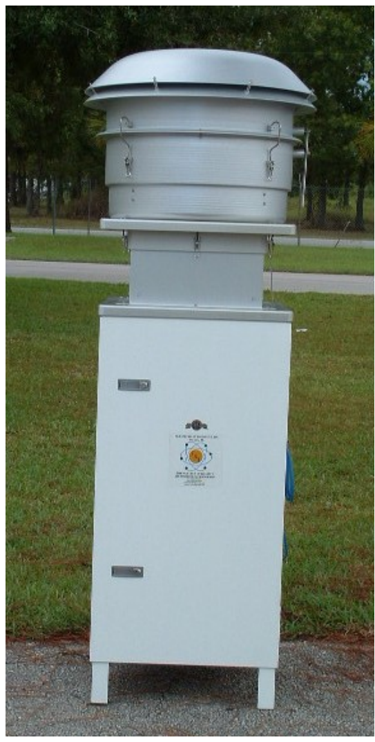
GAS-PM10DTE Series System Normal Operating Scenario