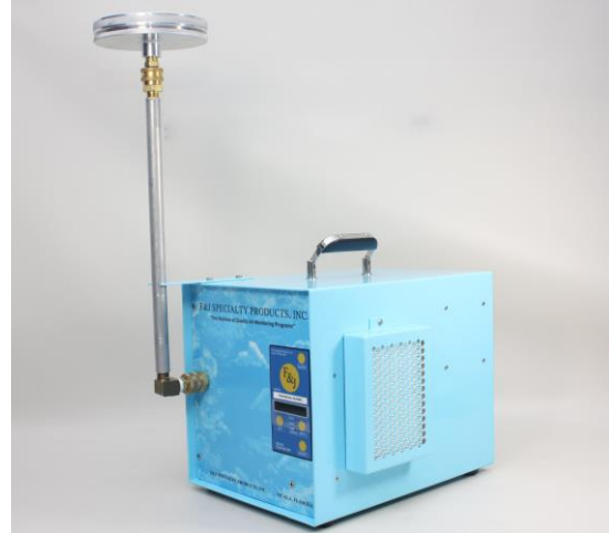
Pictured with 130mm FJ-130 Filter Holder Vertically Mounted