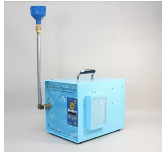
Pictured with 47mm FJ-46P Filter Holder Vertically Mounted