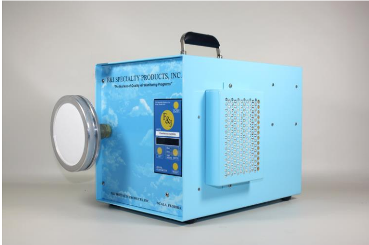
Pictured with 130mm FJ-130 Filter Holder