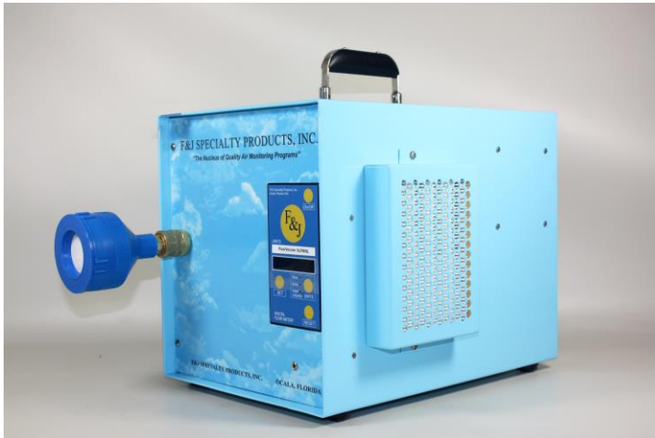
Pictured with 47mm FJ-46P Filter Holder