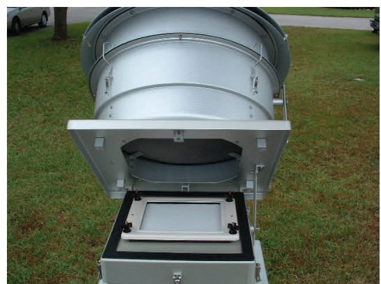
GAS-PM10D Series System PM10 Inlet Open Position for Access to Filter Paper