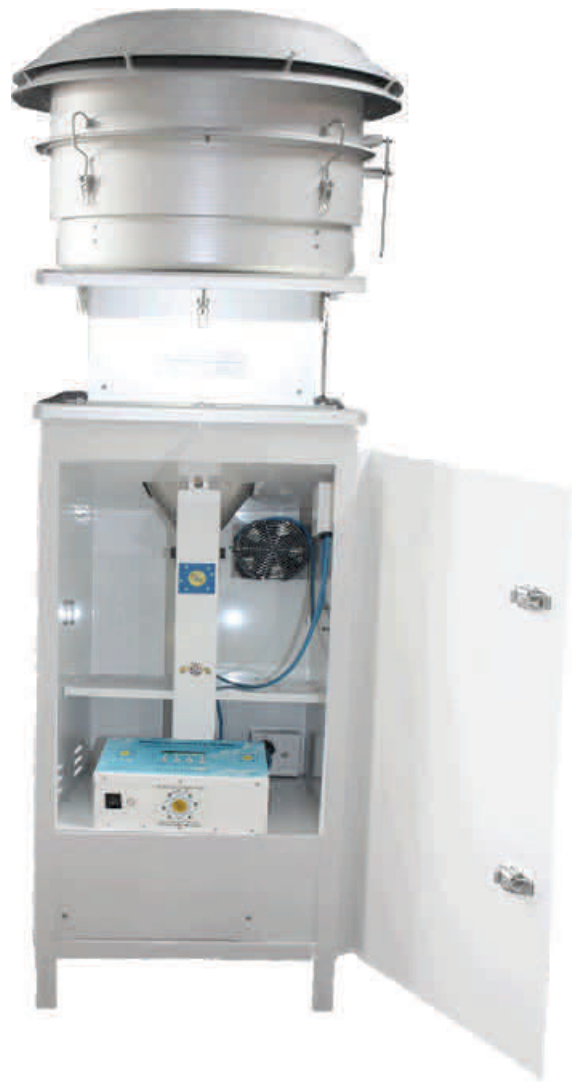
GAS-PM10D Series System Enclosure Door Open