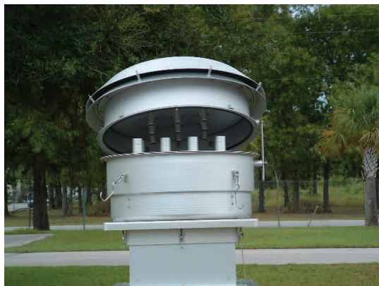
View of PM10D Size Selective Inlet illustrating interior features