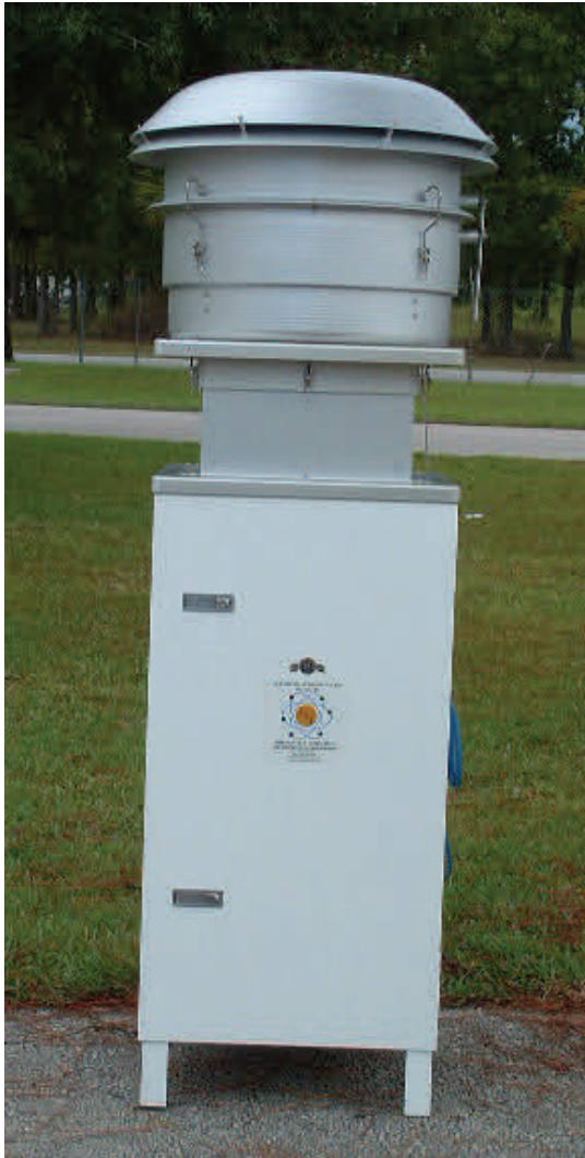
GAS-PM10D Series System Normal Operating Scenario