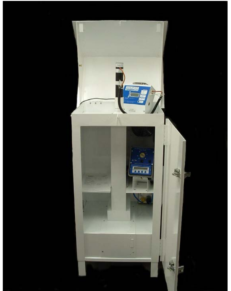
Calibration Setup for F&J's Digital High Volume Air Sampler; Model DH-604V.2