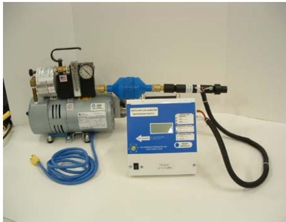
Calibration Setup for Portable Low Volume Air Sampler with Small Diameter Filter Holder