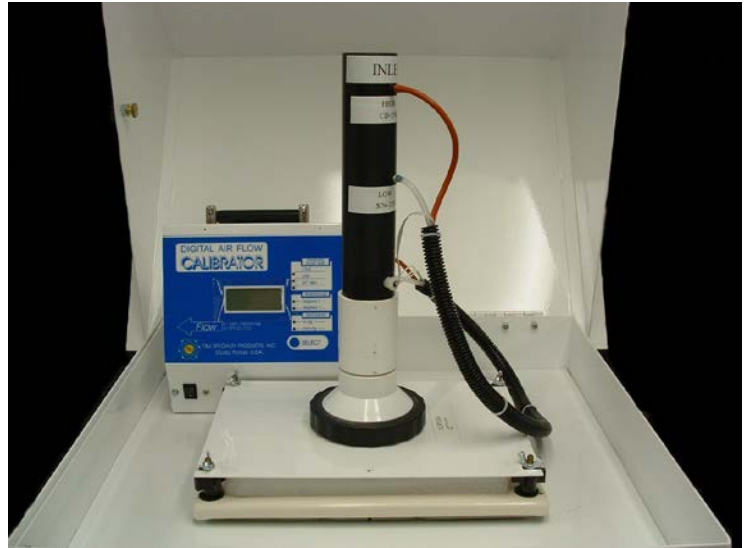
Calibration Setup for High Volume Air Sampler with 8"×10" Filter Holder