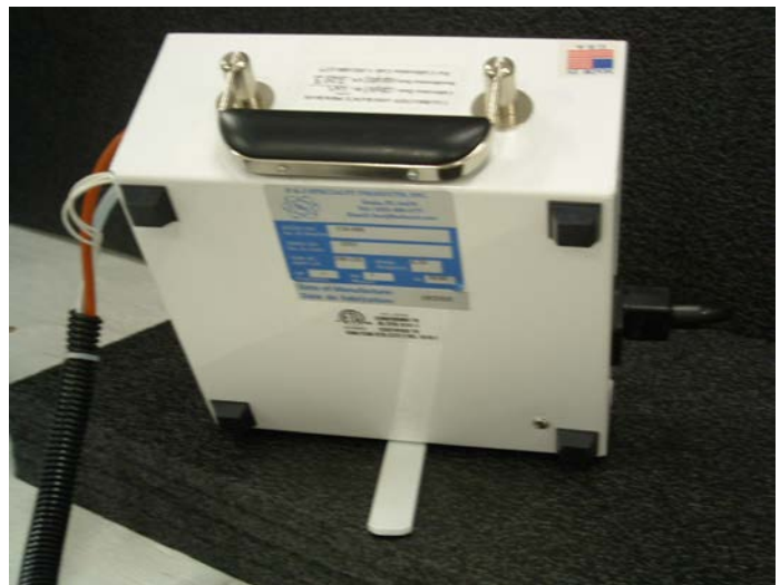
Rear View Illustrating Support Mechanism