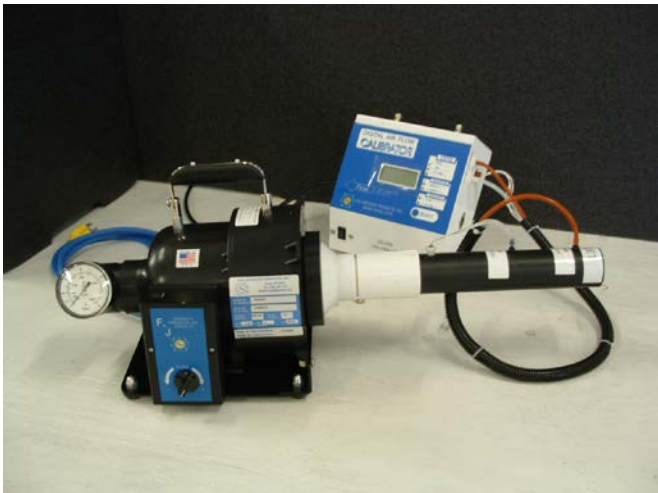
Calibration Setup for Portable High Volume Air Sampler with 4" (102mm) D Filter Holder