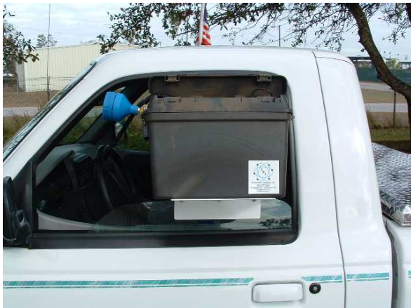
Air Sampler on window bracket

Cigarette Lighter Cord stores in Compartment accessible from outside.