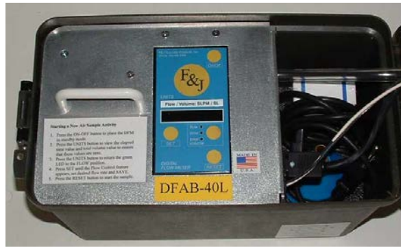
View of Inside