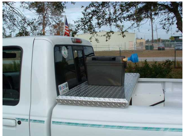
Connection to vehicle cigarette lighter for 12VDC or sampling applications