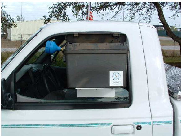
Air Sampler on window bracket

Cigarette Lighter Cord stores in Compartment accessible from outside.