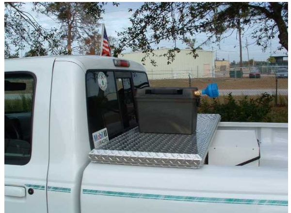
Connection to vehicle cigarette lighter for 12VDC or sampling applications